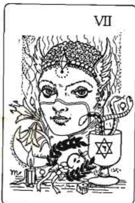
Seven of Cups

Those of you with artistic talents might like to design your own cards. This is good if you can do it, since the deck will relate directly to yourself and your ideas. I personally like the idea of a photographic deck, though